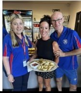
Thursday night dinners